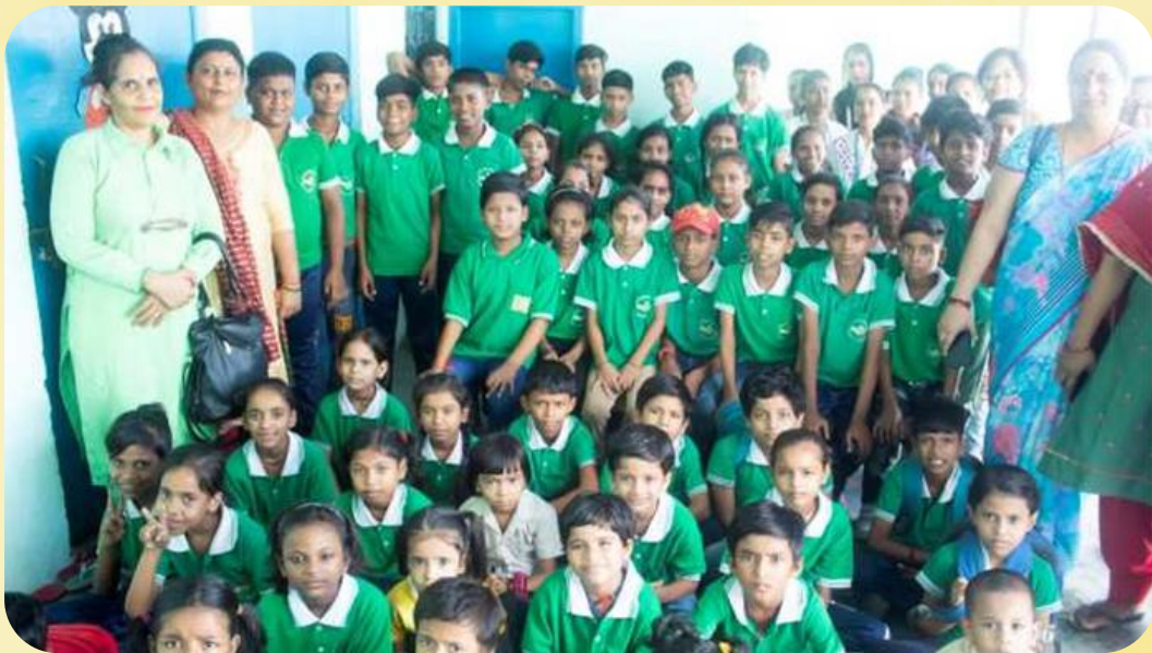
Mera Sahara Center, Nithari Village, Noida, Uttar Pradesh, India.

Orientation sessions with teachers, community members and staff have been held. The roster for meetings, teacher's schedules and nutrition timings for the children were discussed in these sessions. During these meetings, the number of families who had returned to the area were also assessed. We were pleased to note that majority of the children had come back to our Centre to continue their education.